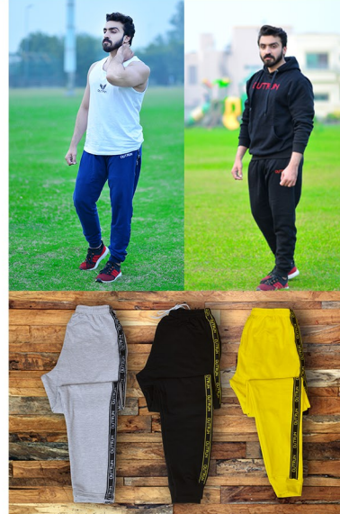
OS-2204 OS-2205 OS-2206